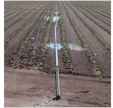
Aluminum System – Puddling Around Leaking Joints

Some or all of these products are protected by patents. Visit www.westlakepipe.com/patents for more information.