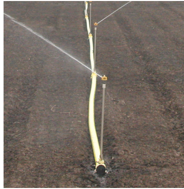
Certa-Set System – No Leaking Joints

The Certa-Set PVC piping system offers durability, flexibility and performance aluminum systems can't match. One of Certa-Set's best features is leakproof operation, which eliminates the puddling (and crop damage) that can plague aluminum systems.