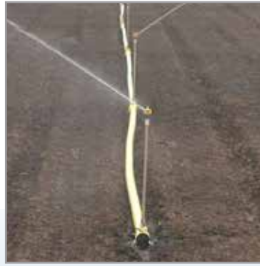
Certa-Set System – No Leaking Joints

The Certa-Set PVC piping system offers durability, flexibility and performance aluminum systems can't match. One of Certa-Set's best features is leakproof operation, which eliminates the puddling (and crop damage) that can plague aluminum systems.