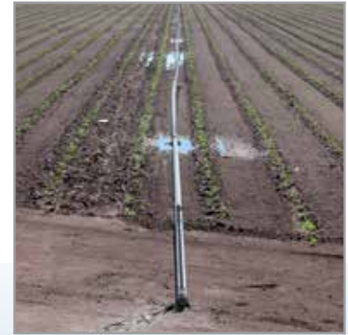
Aluminum System – Puddling Around Leaking Joints